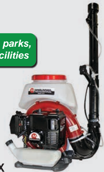
Mist Blower MD181DX