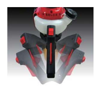
5 Position Rotational Handle The handle can be positioned every 45 degrees giving the operator excellent cutting flexibility.