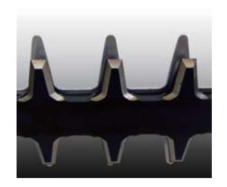
3 Cutting Surface Blade The induction hardened chrome steel blades are polish ground sharpened on all three cutting surfaces for a cleaner cut.