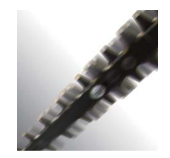
When it comes to blade speed, MARUYAMA hedge trimmers are extremly fast. Giving a cleaner cut each and everytime.