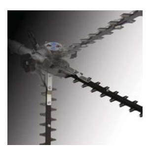
Articulated Blade The AHT235D series features an articulated blade which can rotate 132°.