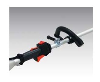
Ergonomic Design Handle Grip Our ergonomic-design handle grip offers superior comfort and excellent balance for the user.