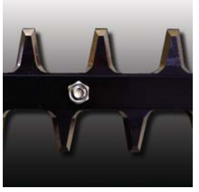
3 Cutting Surface Blade The induction hardened chrome steel blades are polish ground sharpened on all three cutting surfaces for a cleaner cut

*2 Guaranteed sound power level (LWAG), determined according to directive 2000/14/EC