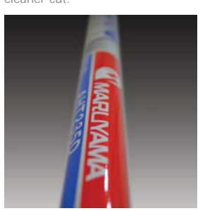
Extended Shaft The AHT235D-S(24) extended shaft has a reach of 770mm long, giving the operator more control and mobility.